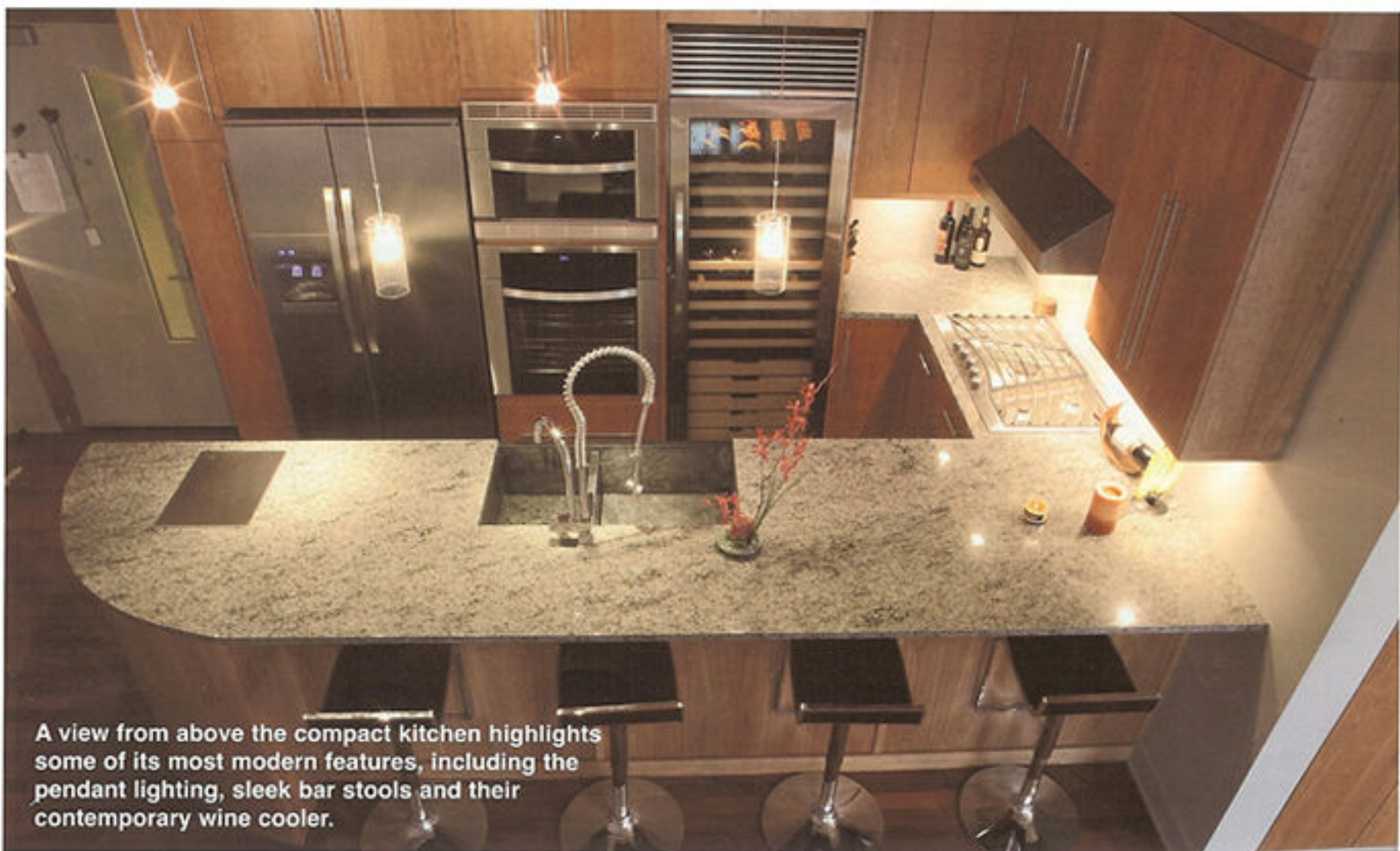
A view from above the compact kitchen highlights some of its most modern features, including the pendant lighting, sleek bar stools and their contemporary wine cooler.